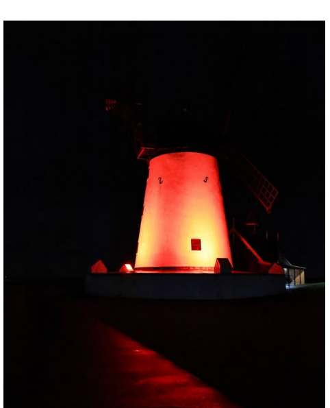
Lytham Windmill Lancashire, England, UK