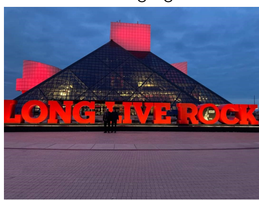
Rock and Roll Hall of Fame Cleveland, Ohio, USA